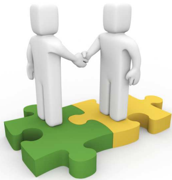
Entrepreneurship and Innovation Programme (EIP)