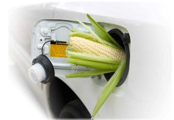
Intelligent Energy Europe (IEE)