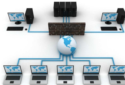
Information Communication Technologies – Policy Support Programme (ICT - PSP)