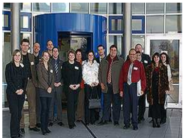
The Project Team

The Gozo Centre for Art and Crafts has received response from 33 students who attend secondary school classes, to participate in The Eco-Recycler – Treatment of Biodegradable Waste course. Through online tuition and relative teaching support at the Gozo Centre for Art and Crafts, these participants are being given the opportunity to get a certificate which will eventually also help them when they apply for related jobs. This is an added service which maximises the potential of the role of the Gozo Centre for Art and Crafts as a promoter of eco-friendly practices. It also ties in well with the eco-Gozo concept, which is being considered as an ambitious, but realisable target, to be achieved over the coming years.