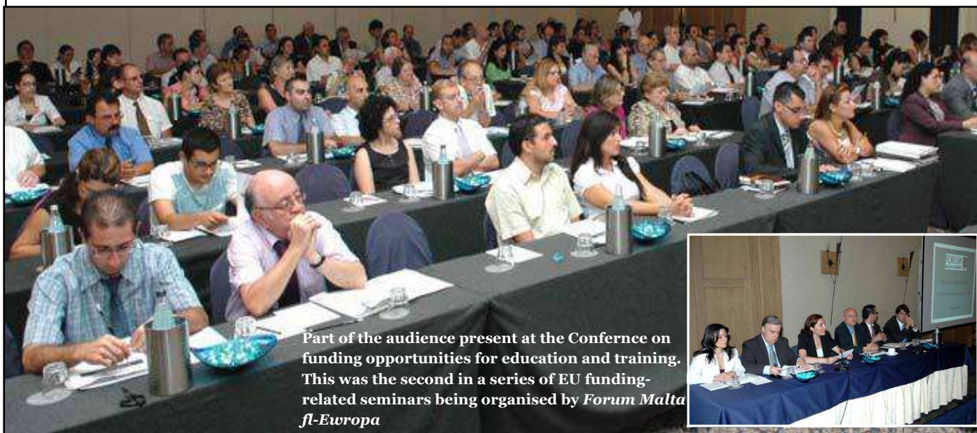
Part of the audience present at the Conference on funding opportunities for education and training. This was the second in a series of EU funding-related seminars being organised by Forum Malta fl-Ewropa

Presentations delivered during this event can be downloaded from the Events section of www.forummalta.gov.mt