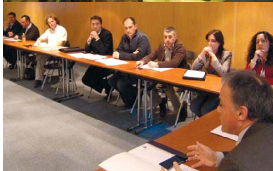
L-ewwel laqgħa tal-Kumitat Settorjali tal-Impjeg, Politika Soċjali u Sahħa u ta' dak tat-Trasport, Telekomunikazzjoni u Energija

għall-ewwel darba, u dan se jagħmluh matul il-gimghat li ġejjin. Dawn huma dak tal-Affarijiet Ekonomiċi u Finanzjarji; dak tal-Ambjent; tal-Edukazzjoni, Żgħażaġh u Kultura; tal-Gustizzja u Affarijiet Interni u dak tal-Agricoltura u Sajd. Sadanittant, l-għaqdiet kollha li qegħdin jiehdu sehem fil-Kumitati Settorjali, imma wkoll oħrajn li wrew interess, qed jirċievu aġġornamenti dwar żviluppi Ewropej. Dawn l-aġġornamenti jinsabu wkoll fuq is-sit elettroniku tal-MEUSAC taħt is-sezzjoni tal-konsultazzjoni.