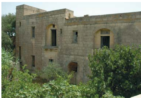
The building which was erected on part of the Ta' Bistra complex earmarked to be the visitors' centre

The ultimate aim of the project was that of making both sites accessible to the general public. Given the Council's financial limitations, it was decided to concentrate on one section of the Ta' Bistra site: that situated underneath a 1950s construction which had become derelict and was in a dangerous state. Initial work comprised cleaning debris and other rubbish which had accumulated in the decades of abandonment. The site was also secured by the reconstruction of the boundary rubble wall and the vegetation was cleared or pruned according to instructions from Heritage Malta. In fact, the Council worked in