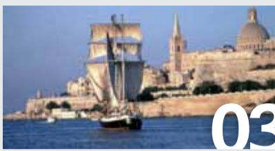
Valletta - European Capital of Culture 2018