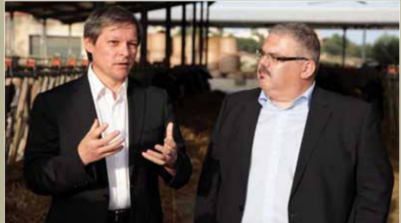
October 28, 2011 Minister George Pullicino accompanies Agriculture and Rural Development Commissioner Dacian Ciolos on a visit at a cow farm in San Ġwann which utilised EU funding for renovation and upgrade.