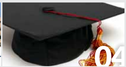
Modern & more effective higher education systems in Europe