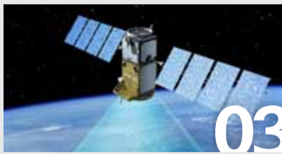
Europe launches its first satellites