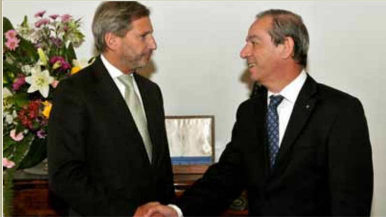
October 17, 2011 PM Lawrence Gonzi meets Commissioner for Regional Policy Johannes Hahn at Castille for bilateral talks about the Cohesion Policy and Malta's funding budget for 2014-2020.