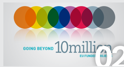
Going beyond 10 million